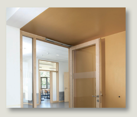
ITS96 Concealed Cam Action Closer Hidden within the door leaf and frame for maximum elegance and design aesthetics, coupled with exceptional ease of opening.

TS99 Electromagnetic Free Swing Door Closer Ideal for individual room access when used in combination with a fire alarm system.